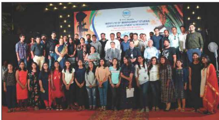
'Alumni Meet - 2019'