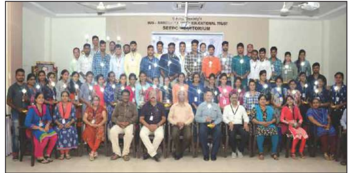
Participants of during the workshop