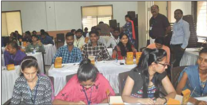
Students Assembling the 'Solar Lamp'