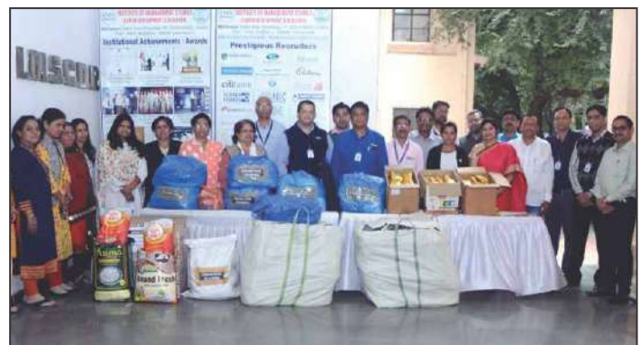
'Donations' to 'Snehabandh', Athare Patil Bal Gruha, Green Sole, Navi Mumbai NGO & Utkarsh Balghar