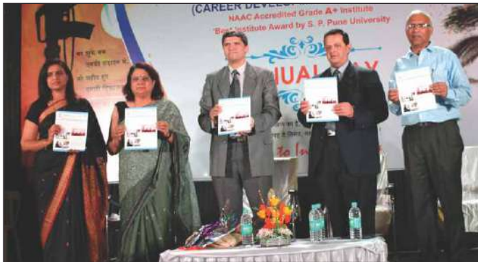
Release of 'IMS - Alumni Newsletter'