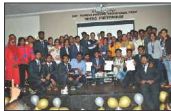
'Award of Enthusiastic Participation'