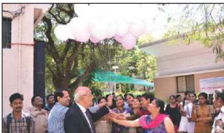
Dignitaries, Faculty members and students celebrating Women's Day