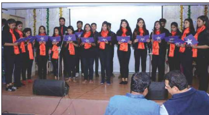
'Carol Singing' by the students during Christmas Celebrations