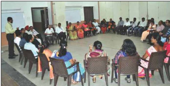
Parents - Faculty members interaction