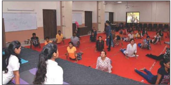
Faculty members & Staff performing Yoga on the occasion of 'International Yoga Day'