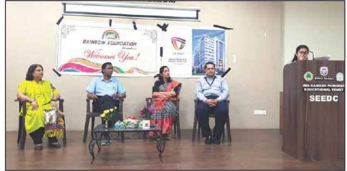
Book review presented by a student