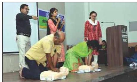
Demonstration on 'Cardiopulmonary Resuscitation (CPR)'