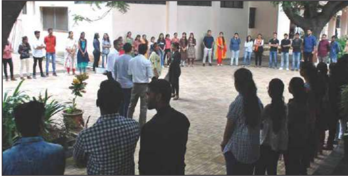
'Ice Breaking Games'