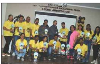
'Overall Championship Trophy'