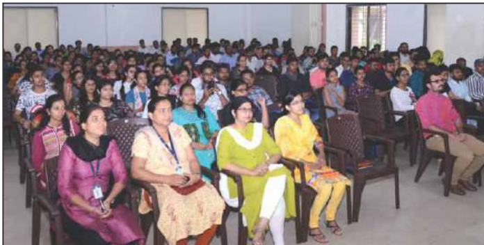
Faculty members and students during the programme