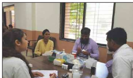
'Haemoglobin Estimation Drive'