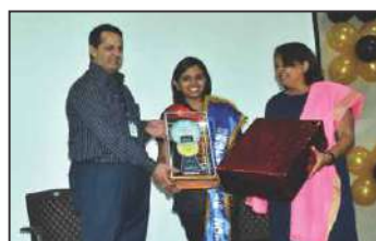
'Best Manager Award'