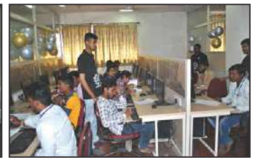
'C Programming Competition'