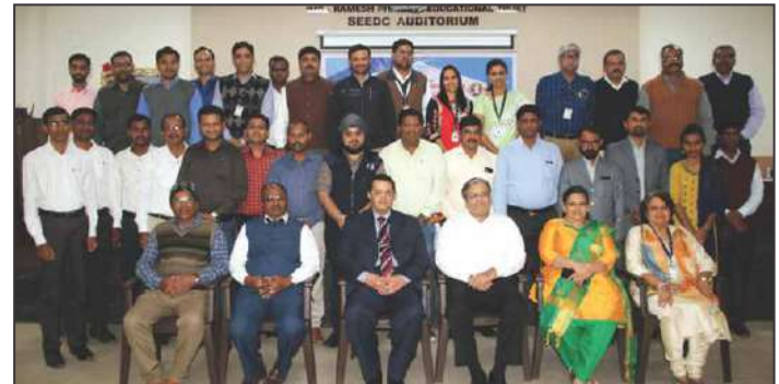
Group Photo with Participants