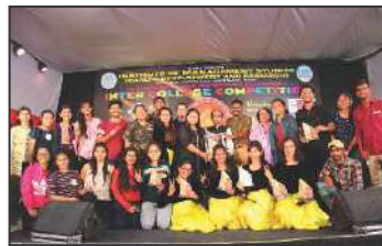
'Overall Championship Trophy'