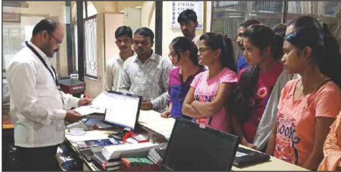
Library staff and students during orientation programme