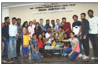
Prize Distribution Ceremony