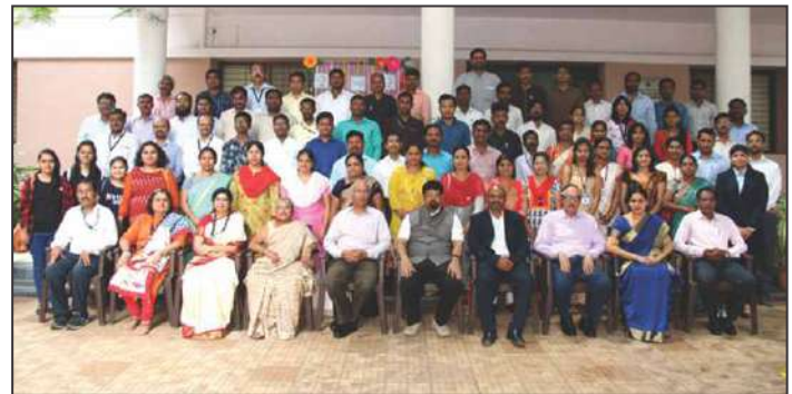
Participants of 'DELNET Workshop'