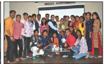
'Award of Excellence'