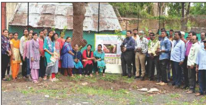
'Tree Plantation Drive'