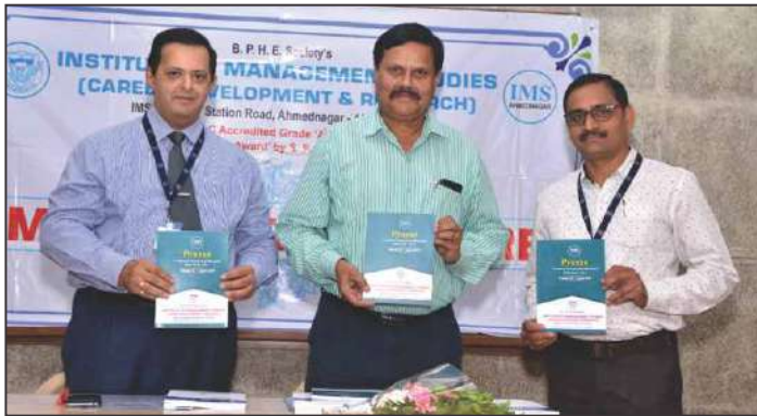
Release of 'PRAYAS' - A Student's Research Journal