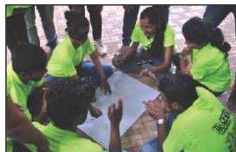
'HR - Team Building'