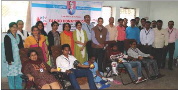
'Blood Donation Drive' on the occasion of Founder's day